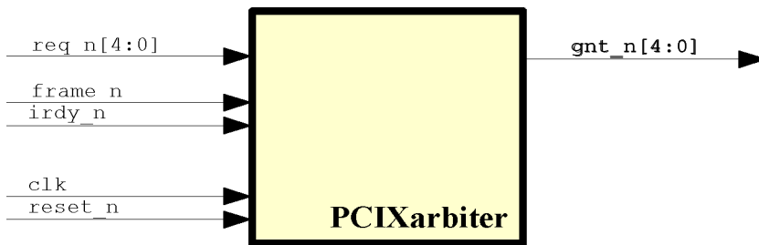
Figure 2: Symbol